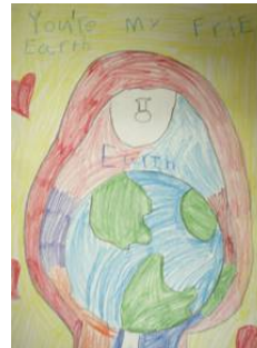
Erica Clarke, age 5, Newtown Square, PA